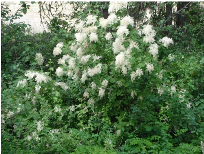
Ocean Spray in bloom, mid-July.

Plant Ocean Spray in your home gardens and build something practical for your personal use out of this beneficial native plant.