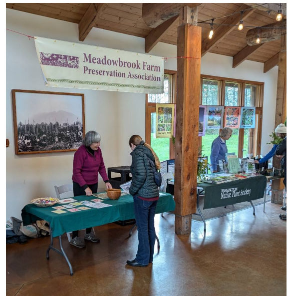
The Oaktoberfest event was held at an ideal time to plant native plants, and attended by enthusiastic gardeners.

The Meadowbrook booth featured information about native pollinators and the Prairie Restoration efforts on Meadowbrook and other upper valley sites. The event was well attended, and most attendees were enthusiastic gardeners. Many were very interested in the prairie restoration project, and a number had not been in the Interpretive Center before, so it was an opportunity to show it off as well. Plan now to attend next year's event!