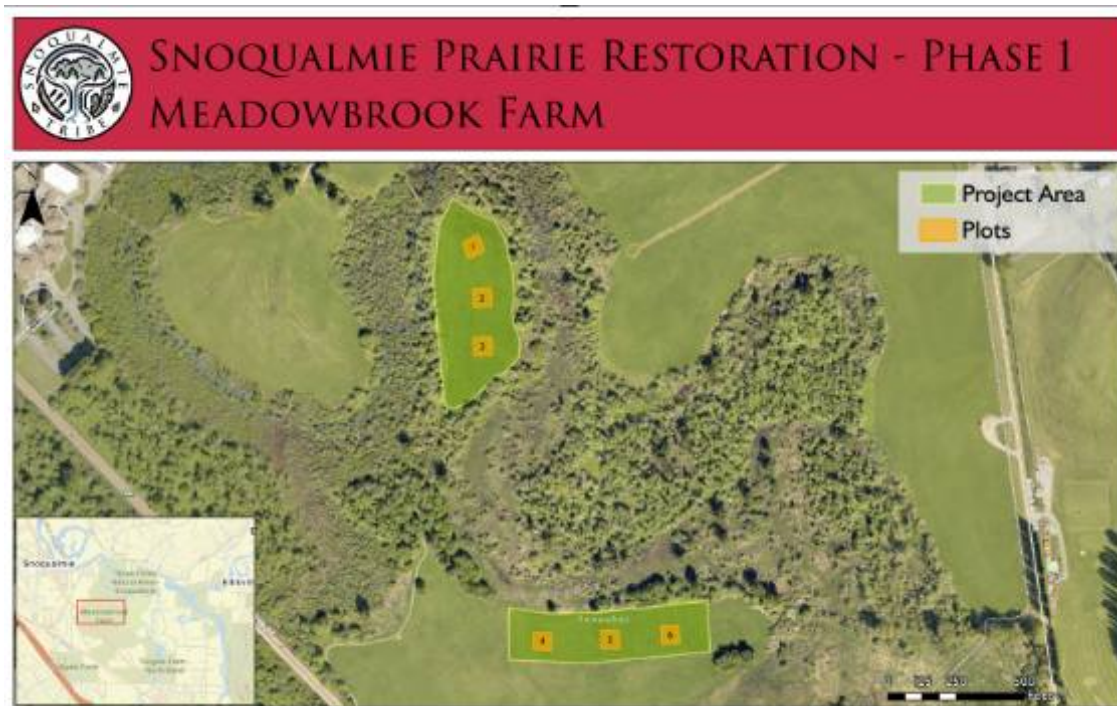
Test plots 20 x 20 meters at varied locations will help plan future plantings.