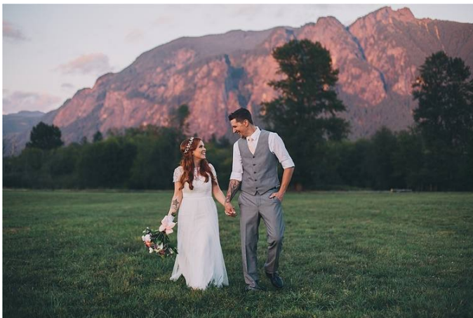
Enjoy your wedding amid natural beauty at an historic site!

Have questions or are interested in reserving space at Meadowbrook? Please contact Travis James with Si View Parks at TJames@siviewpark.org