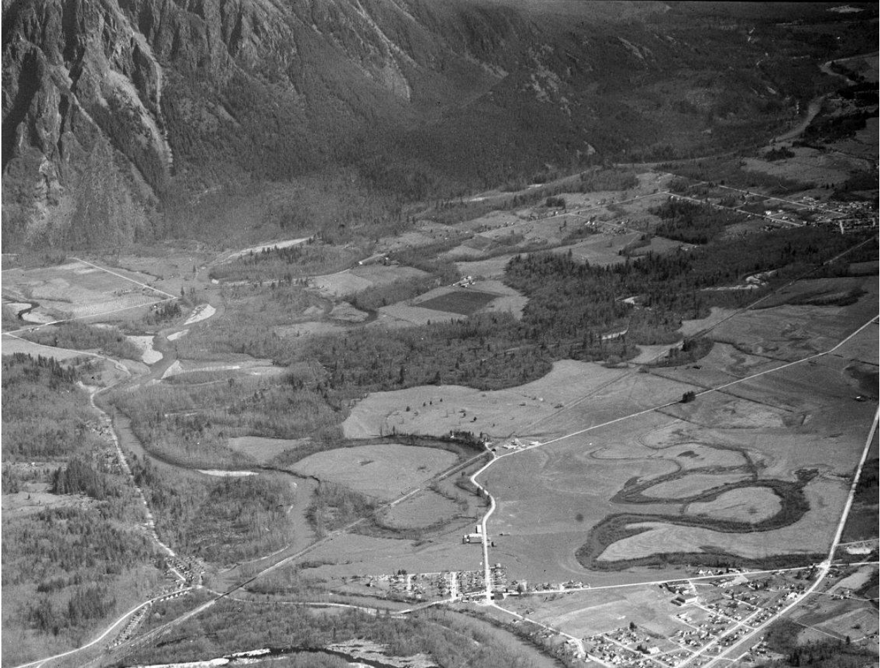
Upper Snoqualmie Valley circa mid 1950's, +/- 100 years after the treaty of 1855. Present day Meadowbrook Farm Park is in the central area of the photo, with other former prairie areas to become school sites, Mt. Si Golf Course, etc.