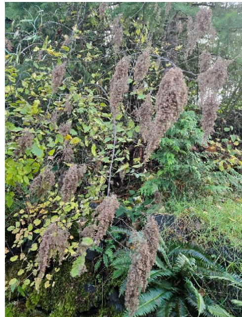
Ocean Spray in November, to help identify it.