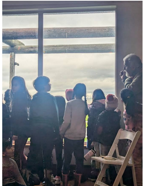
“.. and it all happened right here, on this prairie!” Using the Interpretive Center for site-based history and natural history is relevant and fun!