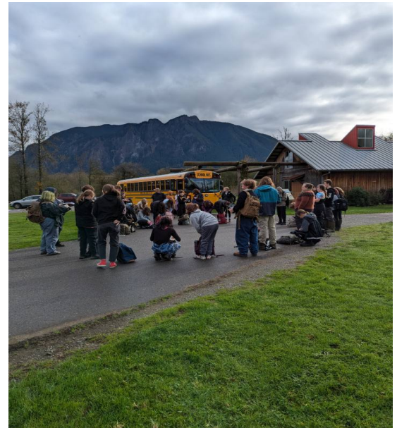
Monroe environmental education students and teachers get out nature journals prior to a field trip walk at Meadowbrook in October.

Fourth grade students study Washington State history, and the MFPA is developing a field trip with hands-on site-related