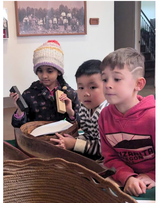
Students learn about the many tribal and pioneer uses of light, workable, long-lasting cedar wood and bark at the Cedar Station.