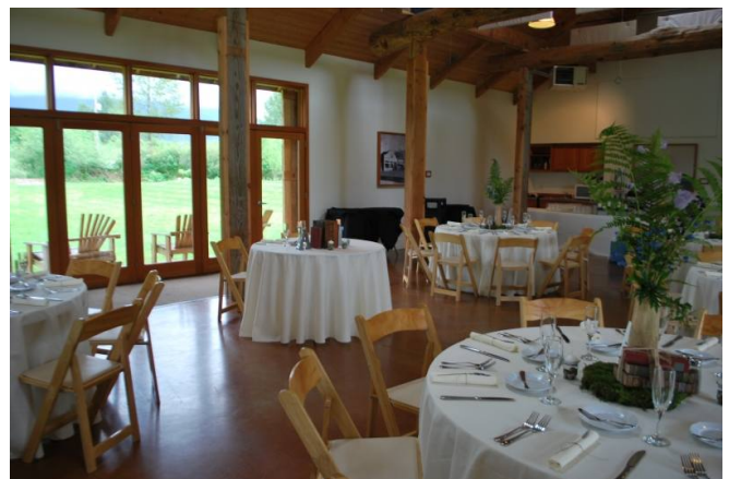
The Interpretive Center accommodates 125 people indoors.