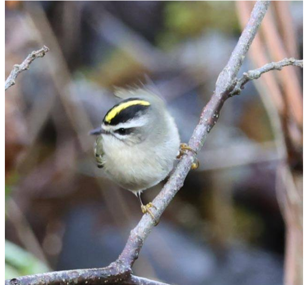
The Golden-crowned Kinglet is a fat, round bird but only about 4" long, tail included!

You'll need to be observant to see a Golden-crowned kinglet , ( Regulus satrapa )! These small birds like dense woods and tangled brush, especially coniferous forests. They may join into flocks, or flock with other similar species, especially during migration and in the winter. Both sexes are distinctive with their yellow head stripe; their backs are grayish brown, and their breasts and undersides lighter gray. Their wings are banded with a black and white stripe. Males have a tiny orange stripe in the center of their yellow head stripe.