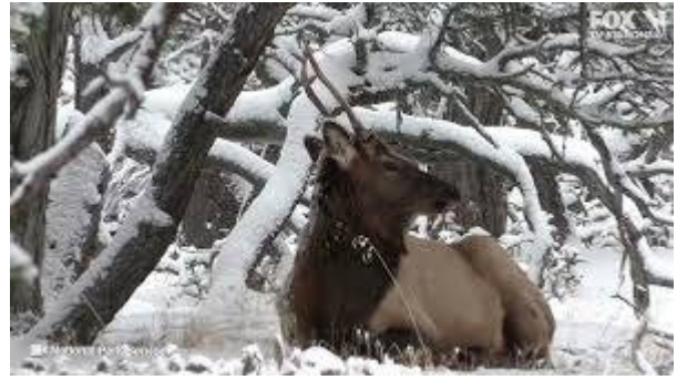
In cold weather, elk may shelter under trees that can block the wind. Long, thick winter coats may be 7 times warmer than summer hair!

When the Meadowbrook Farm Preservation Association's 25 year management agreement for Meadowbrook ended in June 2023, maintenance of the land transitioned to the Si View Metropolitan Parks District. The MFPA now focuses on interpretation, education and stewardship for the public open space land. In November, a Memorandum of Understanding was approved between the MFPA and the two cities, detailing the parameters of these new endeavors. This was the last of the series of "transition" agreements between Meadowbrook parties. The involvement of the Snoqualmie Tribe may be considered by the cities in a future partnership.