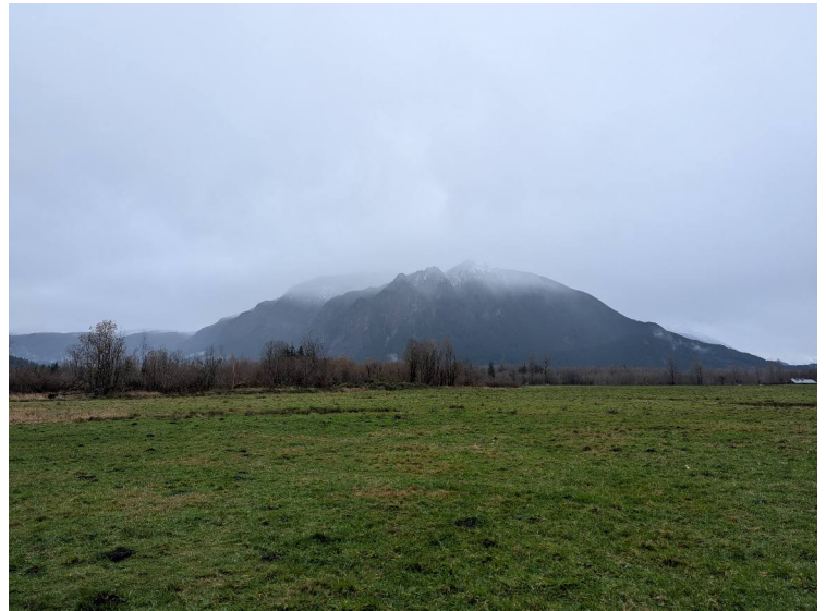
A winter's day at Meadowbrook, with the first snow on Mt Si.

Ground Hog's Day Hike! Sunday February 2, 9 am Meet at Meadowbrook Interpretive Center. Celebrate spring or 6 more weeks of winter with a walk on Meadowbrook! We will peek quietly into the hidden meadows to look for elk, enjoy visiting migratory winter birds, look for the first signs of new life at the newest prairie restoration test plots, and return via the paved path. Dress for the weather, with boots for wet areas. Children welcome; may be difficult for strollers. 2.5 miles. Heavy wind or rain will cancel.